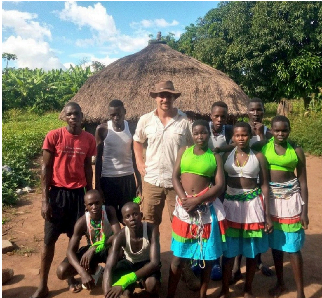
Acholi traditional dancers